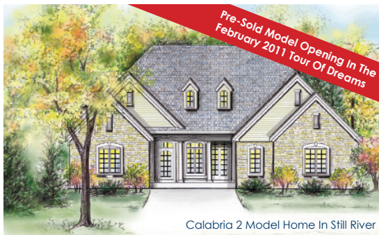
Calabria 2 Model Home In Still River

Call us today and see how Still River lots offer you the best lot value in Waukesha County. Let's talk about putting more 'life' into your Regency Home at Still River. 262-691-9612